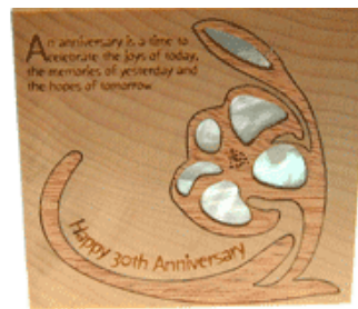
Mother of pearl inlay along with wood inlay of a lily (both traditional for the 30th Wedding Anniversary)

Whether it is the traditional wood for the 5th year—or any of the other milestone Wedding Anniversaries, a Cube is the perfect way to celebrate this day.